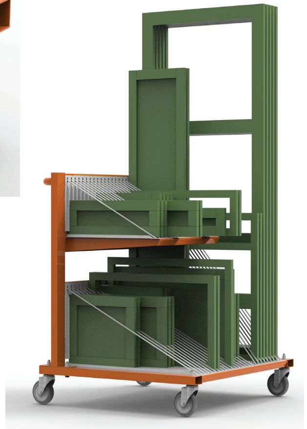
PAPFFDM with PAPFFDM-SHF