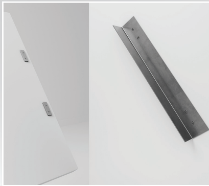
Screw plate to cabinet and screw magnets to your fabricated panel.