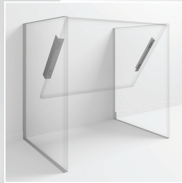
Click panel in place.