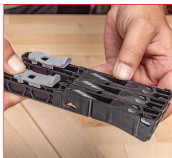
GripMaxx™ anti-slip surface