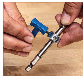
Simple drill bit setup

Pricing Effective 5/1/2023. Subject to change without notice.