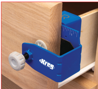
Thick steel and ribbed corners resist flex