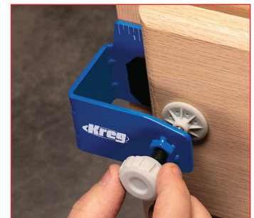
Large Knobs for easy tightening

Pricing Effective 5/1/2023. Subject to change without notice.