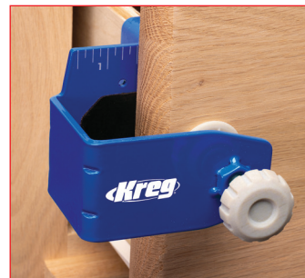
Alignment marks ensure accuracy