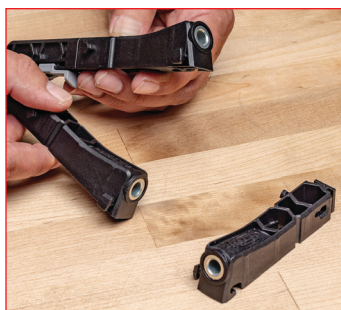
Twist-apart design for variable pocket-hole spacing