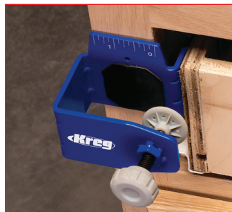
GripMaxx™ holds tight and protects material